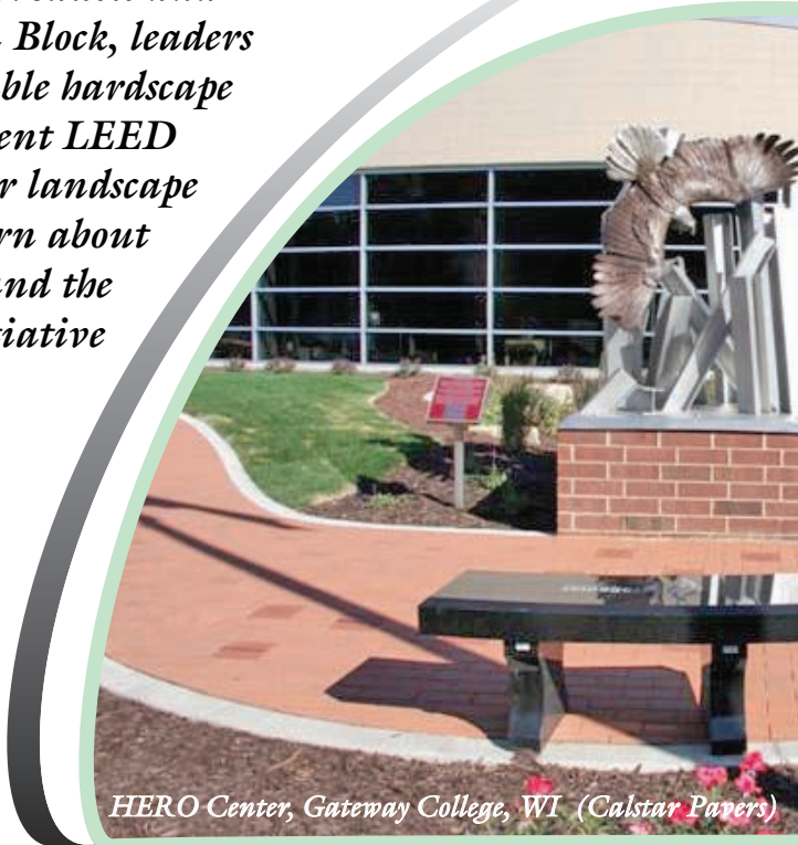
HERO Center, Gateway College, WI (Calstar Pavers)